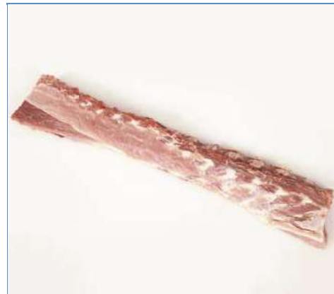
5 London Rib Rack is cut into portions of 30 mm wide.