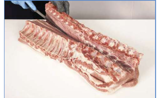
3 Remove vertebrae's and feather bones leaving a minimum of ...