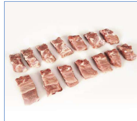
6 London Ribs.