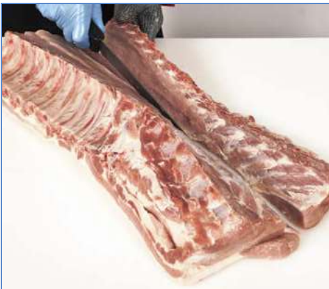
4 ... 20 mm of meat on the bones.