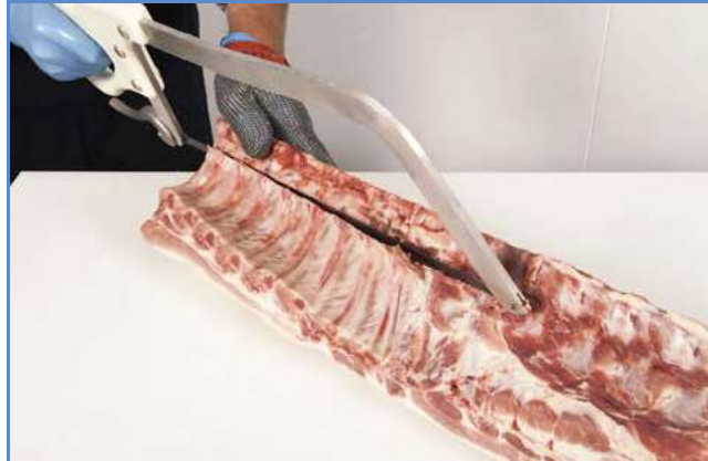
2 The ribs are sawn through at a point where they join the vertebrae including flat bones of the lumbar section.