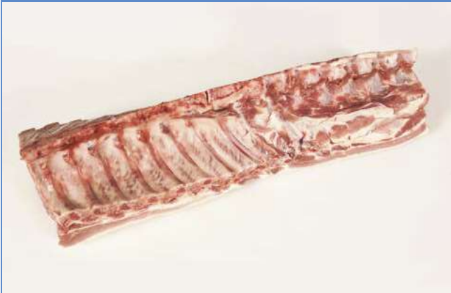
1 Loin of Pork – bone-in, rindless, excluding fillet.