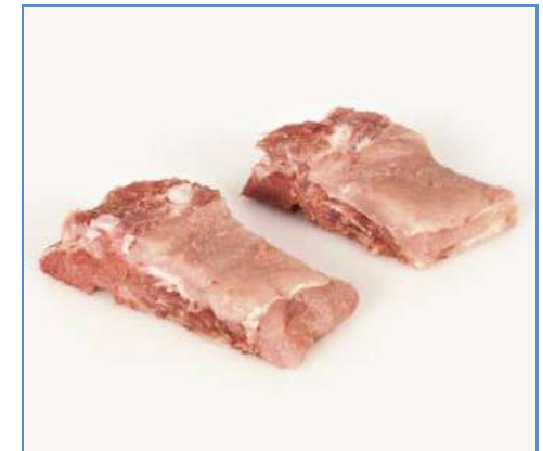
7 London Ribs.